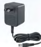
AC Adapter (optional)

Options Stainless steel pan (HT-10) AC adapter