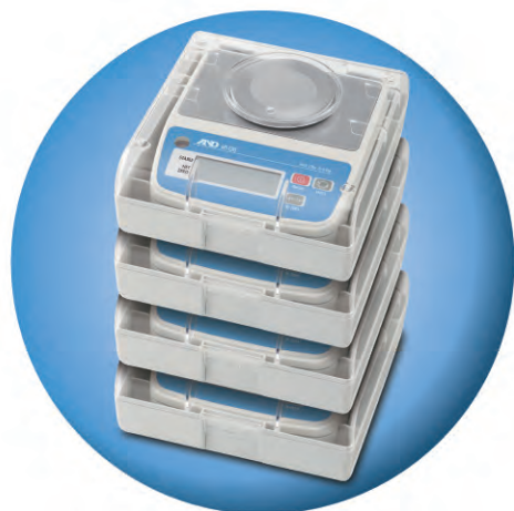
Stackable Carrying Case (Standard)