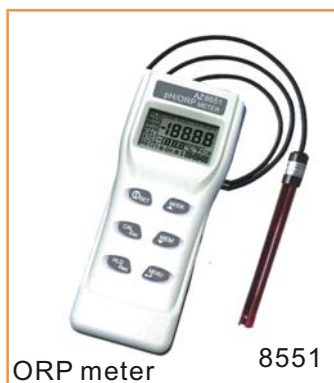
ORP meter 8551