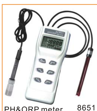
PH&ORP meter 8651