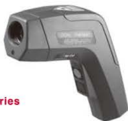
AR-6500 Series Handy type

AR-6500シリーズは、非接触で温度測定が可能な放射温度計に、接触式温度計の機能を搭載した温度計です。