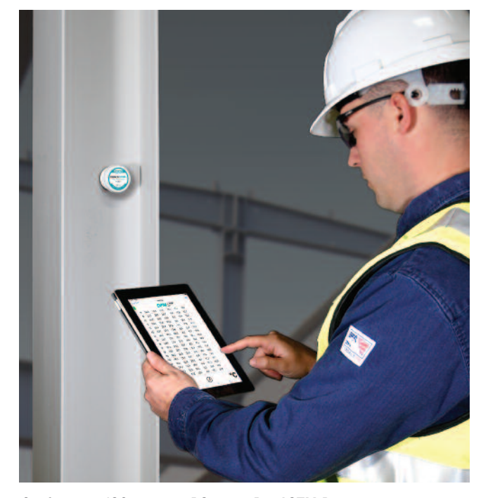
Conforms to ISO 8502-4, BS 7079-B4, ASTM D3276, IMO PSPC, SSPC-PA7 and US Navy NSI 009-32.