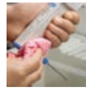
IP54 sealed for easy cleanup