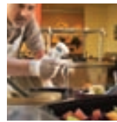
Steam tables and salad bars