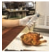
Probe meat and poultry