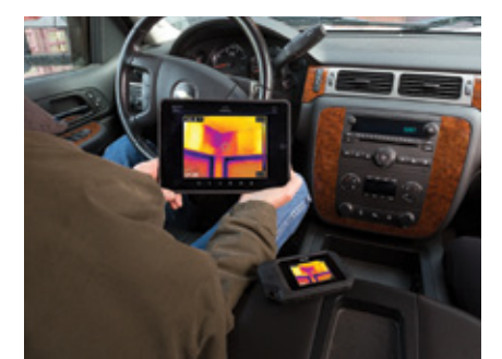
Upload images to FLIR Tools over Wi-Fi

The C3's must-have features include MSX® real time image enhancement, area maximum or minimum temperature measurement, and Wi-Fi connectivity — so you can quickly get to the job of finding hidden problems, sharing images, and documenting repairs.