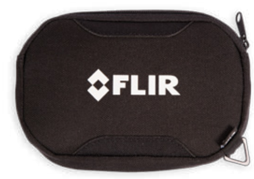
FLIR C3 with Tripod Mount & Carry Pouch