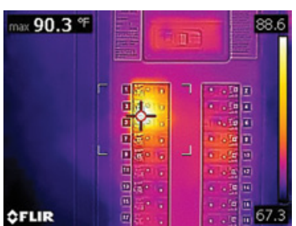
Area box with Hot Spot demonstrates electrical fuse is active