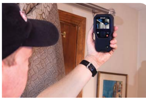
Scanning ceiling & wall joint for moisture issues