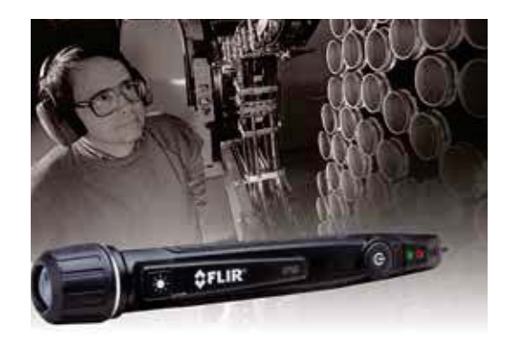
Vibrating voltage detection for loud industrial environments

VP50......CAT IV Vibrating Non-Contact Voltage Detector + Flashlight