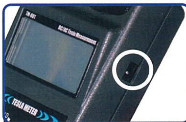
INPUT TERMINAL FOR AC POWER SUPPLY