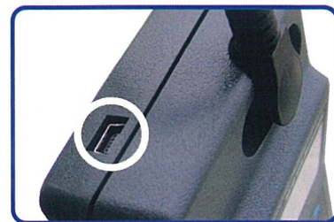
INPUT TERMINAL FOR USB