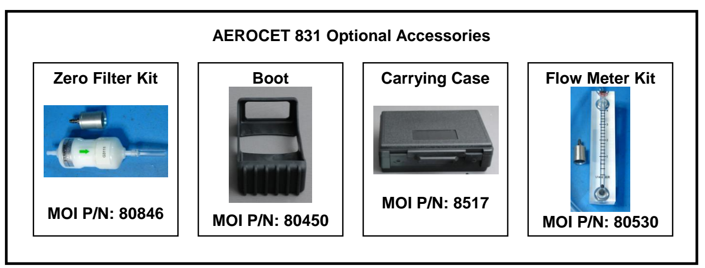
Figure 2 – Optional Accessories