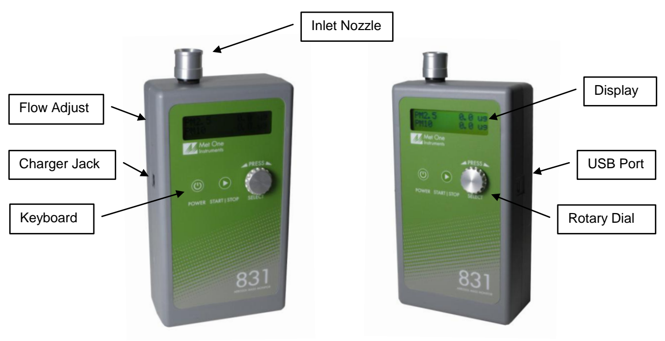
Figure 3 - AEROCET 831 Layout

The following figure shows the layout of the AEROCET 831 and provides a description of the components.