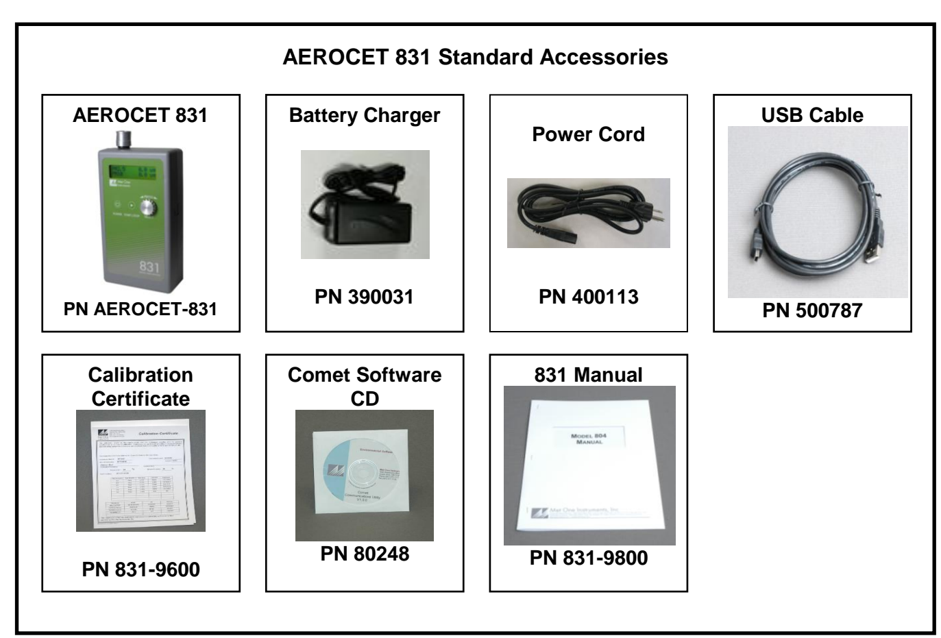
Figure 1 - Standard Accessories