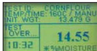
Display shows % moisture, % solids, weight, time, temperature, drying curve and more.