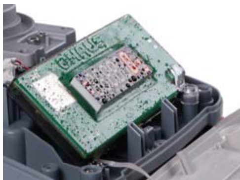
Inside PCBA Silicon Glue Sealing

The flow-thru, water-resistant design allows for safe weighing of liquid components and can be used in harsh or damp environments. Valor 2000's IPX8 full waterproof construction and silicon glue sealing design to its PCBA make it durable in extreme environments and eliminates the risk of water damage. Additionally, cleaning your scale has never been safer and easier, further ensuring the cleanliness of your workstation.