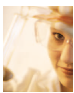
Healthcare, the sciences