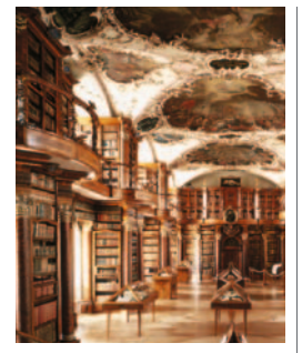
Museums, art galleries

The HygroPalm2-series (with integrated or interchangeable probes) is ideal for all applications where exact measurement of humidity and temperature is of decisive importance, e.g. the food and pharmaceutical industries, printing and paper industries, many trades, the sciences, meteorology, agricultural sector, climatology, etc. There is hardly a field today in which these parameters may be ignored. It is ultimately the measuring task at hand that defines the HygroPalm instrument that best meets your needs.