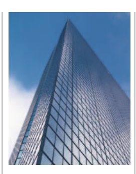
HVAC / Building management