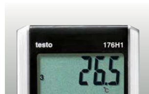
Large, clear display for showing measurement values