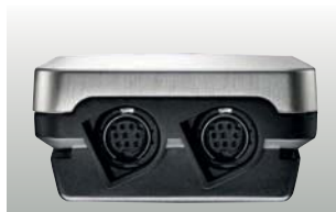
Probe connection at lower end of housing for two temperature/humidity probes