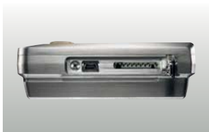
Lateral connection of Mini USB cable and SD card