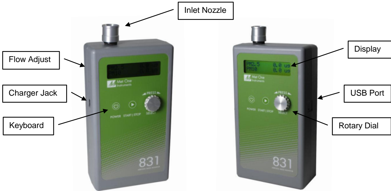
Figure 3 – AEROCET 831 Layout

The following figure shows the layout of the AEROCET 831 and provides a description of the components.