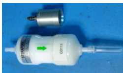
Zero Filter Kit