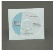
Comet Software CD