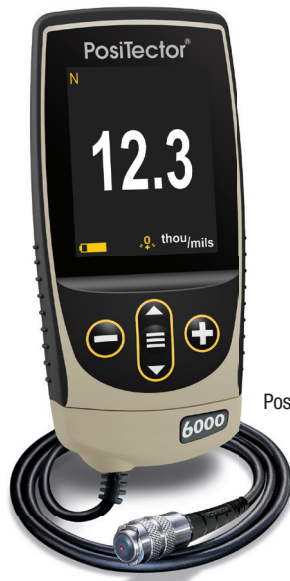
PosiTector 6000 NS3